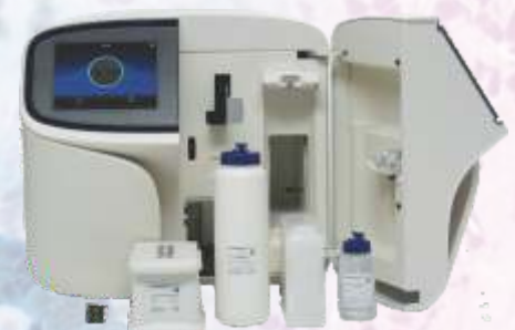
Ion S5 XL System —simple workflow, faster data analysis, higher weekly throughput